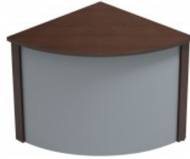
Ashford Reception Corner Metal Desk