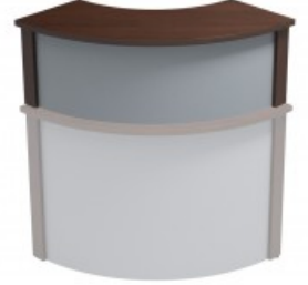
Ashford Reception Corner Metal Riser