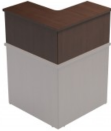
Ashford Reception 90 Degree Corner Riser