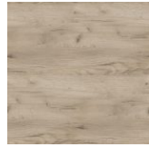
Grey Craft Oak