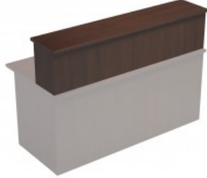
Ashford Reception Desk Riser