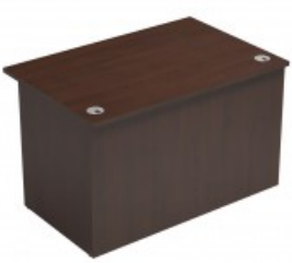
Ashford Reception Desk