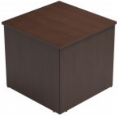
Ashford Reception 90 Degree Corner Desk