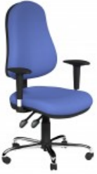
O.E Series, Best Chrome Arms